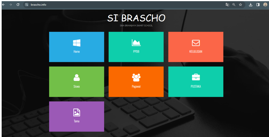
Figure 1. Main View of School Information System

In addition, change requires schools to adapt and reform continuously. Principals must be able to read internal and external challenges in the school's sustainability as a place of learning and teaching (Shaked & Schechter, 2016). Therefore, it can be said that principals are reformers and the ability to anticipate various changes is essential. Principals are expected to be good at change management. School organization is a means by which people work together to achieve common goals using their resources. School organizational development is a systematic, integrated, and planned approach to improving organizational effectiveness and solving problems.