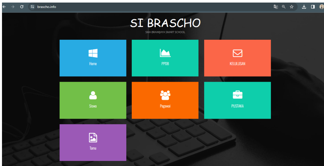
Figure 1. Main View of School Information System

In addition, change requires schools to adapt and reform continuously. Principals must be able to read internal and external challenges in the school's sustainability as a place of learning and teaching (Shaked & Schechter, 2016). Therefore, it can be said that principals are reformers and the ability to anticipate various changes is essential. Principals are expected to be good at change management. School organization is a means by which people work together to achieve common goals using their resources. School organizational development is a systematic, integrated, and planned approach to improving organizational effectiveness and solving problems.