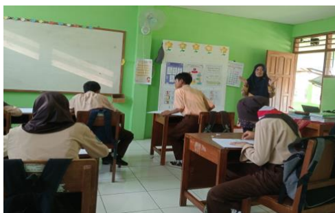
Figure 5. Learning practice with strategies and media by the teacher

called children with special needs, they need special education services. For example, at SLB Bhakti Kencana 1 Berbah, for children with intellectual disabilities, teachers use a way to understand and enter the world of children with intellectual disabilities. This includes an empathetic approach, patience, and understanding of their needs and uniqueness. Learning through play is also done by the teachers. And one teacher only teaches a few children. This is because children with intellectual and cognitive disabilities have limitations. So, the teachers apply these strategies and methods. However, it is different if what is faced is other children with special needs.