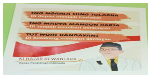
Figure 3. Educational Motto of Ki Hadjar Dewantara

Figure 1 highlighted the importance of learning. One of the meanings of this writing is that students at SLB Bhakti Kencana 1 Berbah are reminded of the importance of being smart. And to be smart, students must learn. So, here indicates the provision of learning motivation for students in the form of writing.