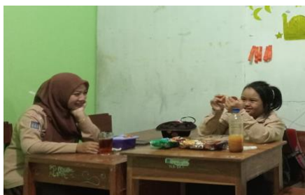
Figure 4. Providing oral motivation for learning

Based on the results of interviews conducted by researchers with SLB Bhakti Kencana 1 Berbah teachers, it was found that every day the teachers provide direction and guidance delivered directly to students and also to the parents of students. Because children with special needs have a special side, so the provision of learning motivation is verbally spoken at all times and repeatedly. Not only that, giving motivation is also done by teachers to parents. So that giving oral motivation can help students with special needs.