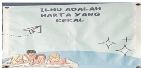
Figure 2. Slogan on the importance of knowledge