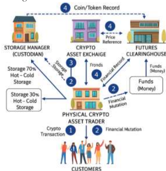
Figure 2. Crypto asset trading transaction mechanism in the Indonesian futures market