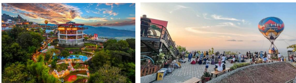
Figure 1.4: Heha Sky Halal Tourism, in Tasikmalaya Regency, West Java

To rectify this, there is a clear need for policy adjustments that take into account the realities faced by smaller businesses. These adjustments could include simplifying the certification process, offering financial support or subsidies for smaller operators, and providing training programs to ensure that all businesses understand the benefits and procedures involved in obtaining halal certification. These measures would ensure that the principles of constitutionalism and Rechtsstaat are applied more uniformly, reducing disparities between large and small businesses in the halal tourism sector.