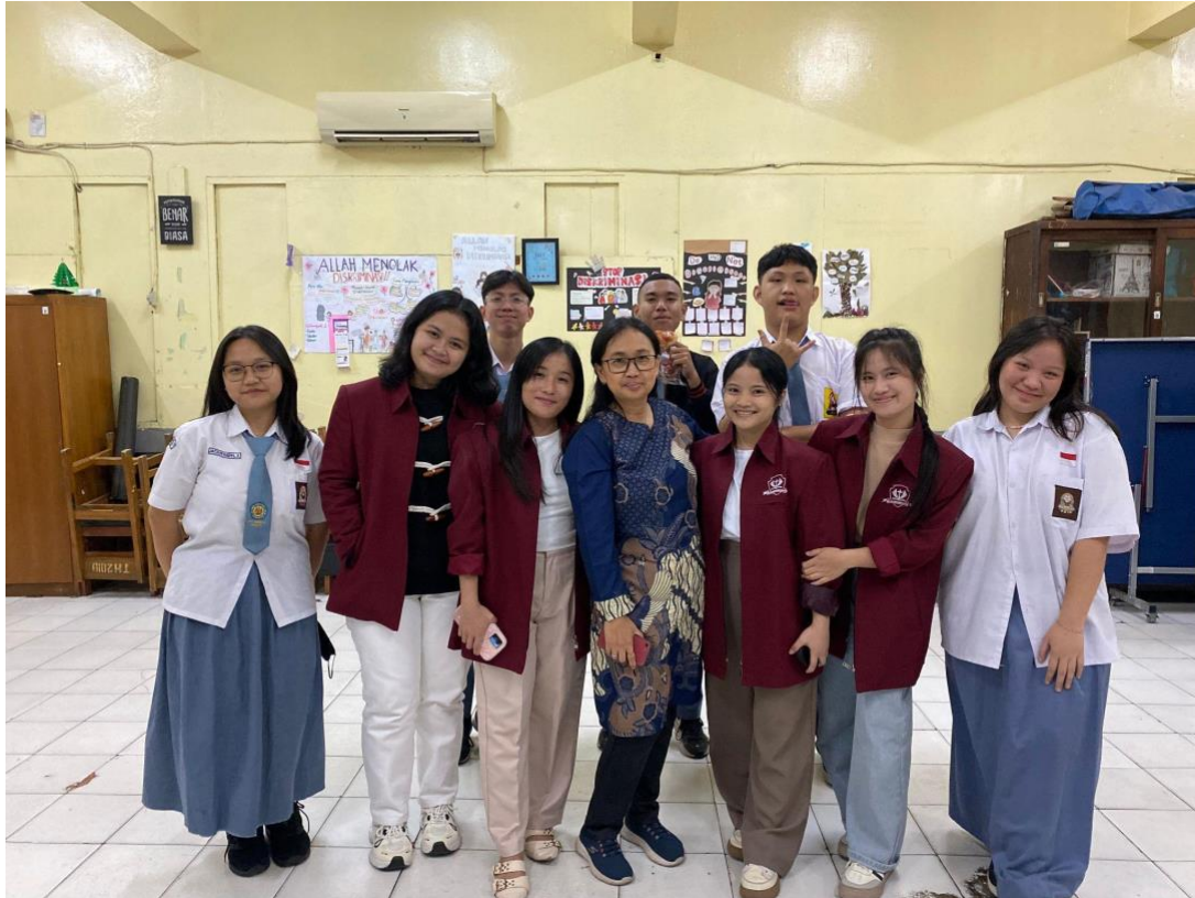
Group photo with grade XI students