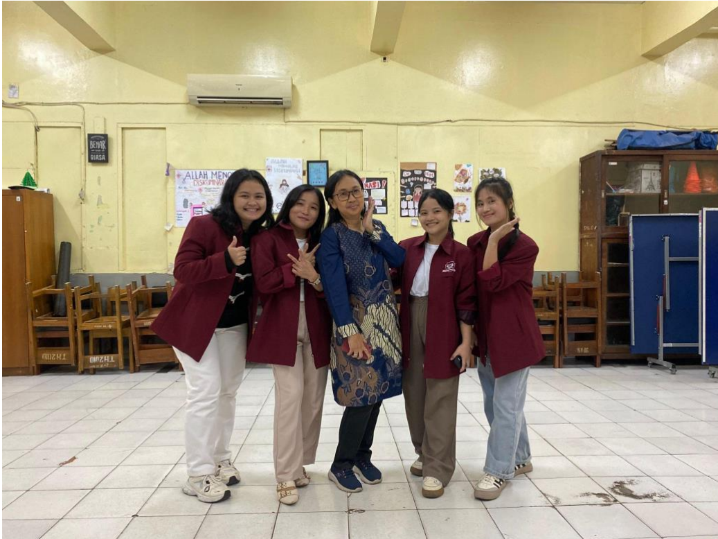
Photo of West Jakarta Police outreach