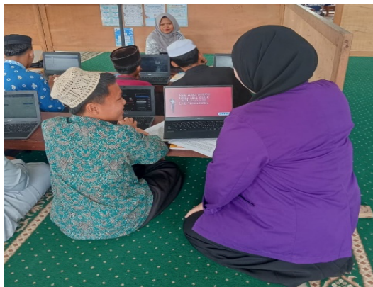
Figure 3 Explaining the Islamic Religious contents trough Youtube