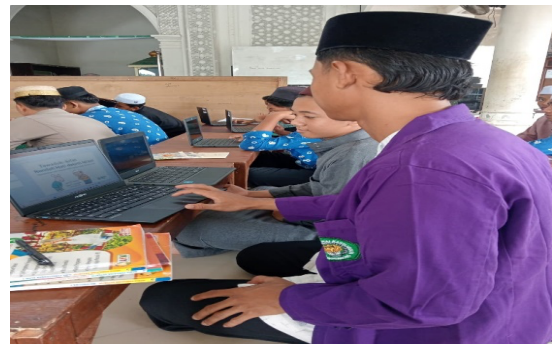
Figure 2 The teacher explains the Islamic Religious contents using power point