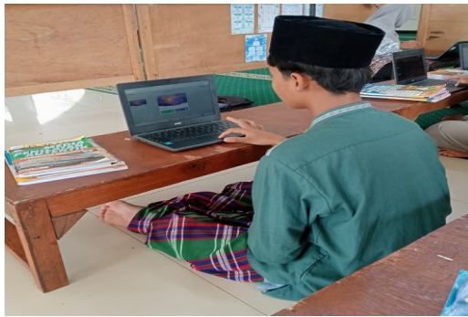
Figure 1 The students are using chromebook while Islamic Religious lesson

In the meantime, observation, interviews, and documentation were used to perform technique triangulation. The Miles and Huberman paradigm, which comprises data reduction, data presentation, and conclusion drawing, was used for data analysis. In every cycle, these three analytical components are repeated and combined with the action reflection's findings (Matthew B. Miles, A. Michael Huberman, 2014). As a result, this study was able to show that using interactive media in a methodical and gradual way improved the quality of Islamic Religious Education instruction.