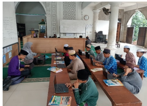
Figure 4 Classroom Action Research at class 9A

Triangulation and technique triangulation were used to assess the validity of the data in this investigation. The findings of observations, teacher interviews, and student grade documents were compared in order to perform source triangulation. In the meantime, a variety of data collection techniques, including observations, interviews, and documentation, were combined to perform technique triangulation. The Miles and Huberman approach,