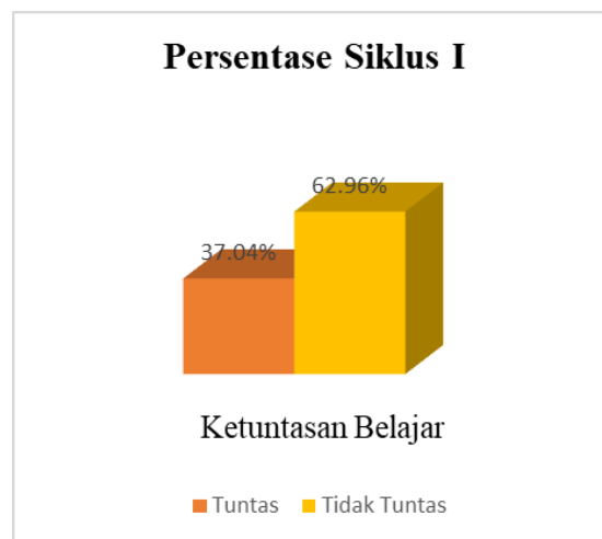
Graph 1. Percentage of Cycle 1 Learning Completeness

However, even though there has been an increase in learning outcomes, there are still some students who have not reached the KKM in cycle I. Therefore, cycle II is needed to optimize student learning outcomes. In cycle II, learning strategies were refined by focusing more on active interaction between students and learning media. Students are encouraged to participate more actively in learning activities and practice more using Wordwall media.