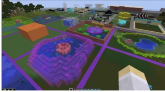
Figure 1 Learning Cells in Minecraft (Pusey & Pusey, 2015)

For example, in biology learning, cells and their parts can be clearly depicted so that students can explore the cells to identify their parts and functions (Pusey & Pusey, 2015).