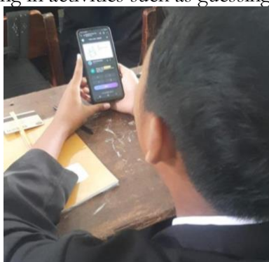
Picture 1. A Student Playing Picture Guessing Game via ClassPoint

The scheduled date for implementation of third cycle is August 21, 2023. While a subset of students may have challenges in utilizing ClassPoint, overall, the learning process is progressing very well. Students demonstrate a great deal of engagement and participation in the learning process, particularly when engaging in activities such as guessing games.