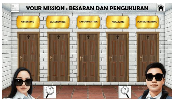
Picture 4.5: The Scientific Doors of Quantity and Measurement Mission

This learning innovation accommodates all student learning styles, including visual, audio, and kinesthetic, through interactive media with engaging audio-visuals and instructions for students to conduct investigations of quantity and measurement based on local wisdom. The exploration process begins with the 'Start' button and follows the flow of 'Goal' > 'Your Mission' > 'Test', with guidance from the role-playing character. The initial step for students is to follow the orientation of prospective detectives by selecting the 'Goal' button to comprehend the DC Boy and DC Girl characters and scenarios. After following the 5-door scientific approach, students, acting as DC Boy and DC Girl, took the test and were subsequently appointed as Detective-C for successfully completing the detective mission of quantity and measurement.