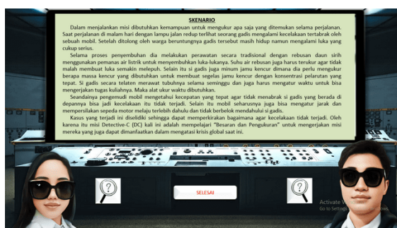
Picture 3: Integration of Role-Playing Scenarios with Culturally Responsive Teaching