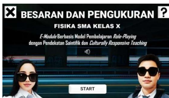
Picture 2. E-Module Home Page

playing scenarios to facilitate learning. Previews of this media can be seen in Figures 2, 3, and 4.