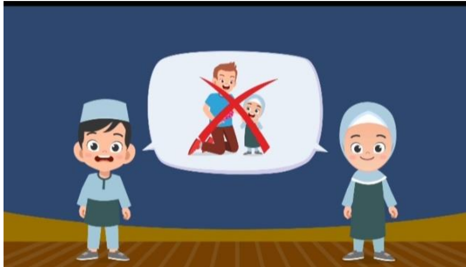
Figure 5. Material 3: Personal Protection and Safety

The final segment introduced children to the concept of self-protection, including how to react in situations of sexual aggression. The video used a problem-based learning approach, where children were presented with scenarios involving sexual abuse and asked to determine appropriate reactions. This method aimed to enhance the children's critical thinking and problem-solving skills in situations involving personal safety.