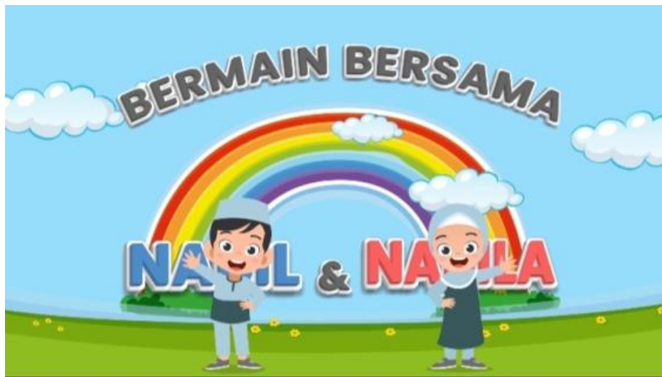
Figure 2. Opening View