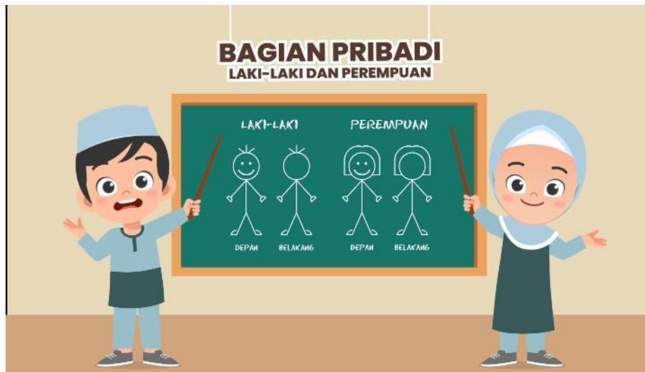
Figure 3. Material 1: Understanding Gender and Private Parts

In this section, the characters Nabil and Nabila explained the differences between boys and girls, focusing on the concept of private body parts and the importance of understanding bodily differences.