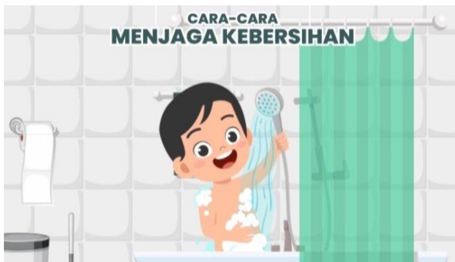
Figure 4. Material 2: Sanitation and Personal Hygiene

In this section, the characters Nabil and Nabila explained the differences between boys and girls, focusing on the concept of private body parts and the importance of understanding bodily differences.