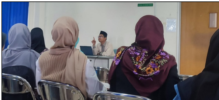
Picture 1. Additional explanations from the lecturer

It 'This study aims to analyze the implementation of Problem-Based Learning (PBL) through the task of developing multiple-choice questions to enhance students' understanding of balaghah concepts. The balaghah classes were conducted twice a week, with 2 credit hours for each session. In the first session, students presented their topics, which were followed by additional explanations from the lecturer. The following session was used to assess students' understanding and evaluate the multiple-choice questions they had developed based on their presentations. In addition to evaluating comprehension, the questions were reviewed for appropriateness and quality in terms of Arabic language usage.