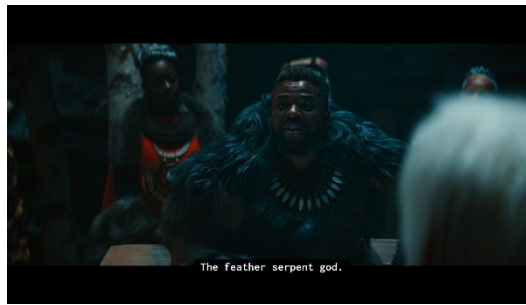
Figure 12: M'Baku explaining what K'uk'ulkan means to Wakandans (2:00:36) Namor representing the protector and the feather serpent god