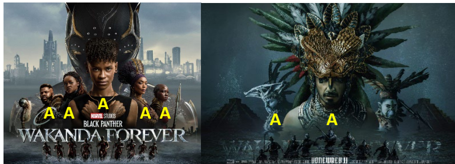
Figure 1: Narrative structure, non-transactional action process

The bottom half of the poster also depicts a non-transactional action process. For easier viewing, the bottom half of the poster is flipped vertically. There are two characters as actors who perform a non-transactional action process on the bottom half, Attuma and Namor. The vectors emerge from them because they also stare directly outside the poster, but there is nothing the vectors aim at. As a result, the action process in the bottom half is similar to the upper half, which is non-transactional action process.