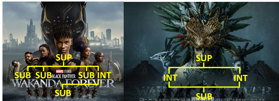
Figure 6: Conceptual structure, classificational process, overt taxonomies

The bottom half of the poster also presents an overt taxonomy. Here, Namor acts as the superordinate since he occupies the highest level in the taxonomy. This is also because Namor is similar to Shuri in being positioned in the center of the hierarchy and having the largest size compared to the other participants. For Attuma and Namora, they are similar to Okoye because they act as interordinates. Attuma and Namora have Namor as their superordinate and the Talokan Army as their subordinate. The hierarchical structure describes the structure of the Talokan kingdom, starting from the king that occupies the highest throne position in the kingdom, followed by his advisors and confidants, and the kingdom army at the bottom. Like the previous taxonomy, the bottom half is a multi-level overt taxonomy as the taxonomy involves two levels connecting the participants.