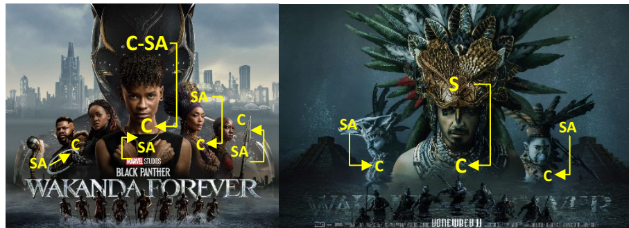
Figure 8: Conceptual structure, symbolic attributive process