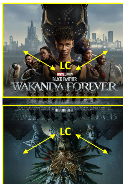
Figure 5: Narrative structure, circumstances

The poster presents locative circumstances. Locative circumstance is the circumstance that connect participants to the setting (Kress & Leeuwen, 2006). The participants here are the characters in the foreground and the settings are their respective kingdoms in the background, Wakanda and Talokan, which signify the location settings of the movie. Both Wakanda and Talokan are presented in the poster not only to represent the settings, but also the two main opposing sides who are having the conflict in the movie plot. The process in locative circumstances involves background and foreground contrast that can be achieved in several techniques (Kress & Leeuwen, 2006).