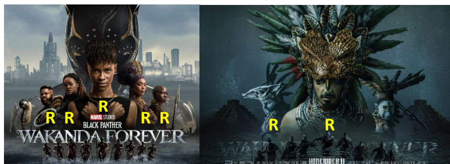
Figure 3: Narrative structure, non-transactional reactional process

The actors in the non-transactional action process also show a non-transactional reactional process. Instead of actors, they are referred as reactors in reactional process. Kress and van Leeuwen (2006) affirmed that a reactor has to be a human or animal that resembles a human being who is capable to show facial expression and have visible eyes with distinct pupils. Hence, all the actors fulfill the criteria to be referred as reactors. The reactors' gaze is directed to their front which signifies that they are reacting to unknown object outside the poster. Similar to the action process, this makes the reactional process non-transactional because there is no phenomenon that the vector is aimed at, as the object the reactors are reacting to is unknown.