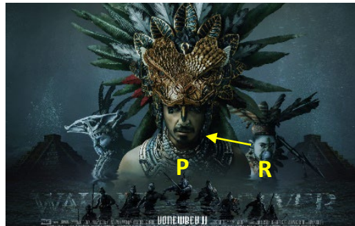
Figure 4: Narrative structure, transactional reactional process

In reactional process, there is also transactional process depicted by Namora as the reactor. The reactor forms an eyeline by looking at a phenomena or the participant as the goal. The phenomena here is Namor because he is the participant where the eyeline is directed to. The vector emerging from the reactor to the phenomena makes the reactional process transactional. As stated by Kress and van Leeuwen (2006), reactional process can also be transactional just like action process, and transactional process contains both reactor and phenomena.