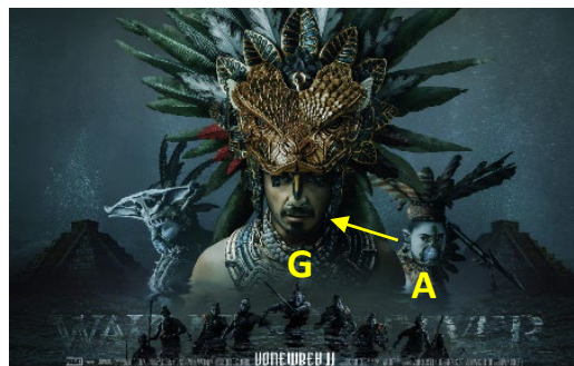
Figure 2: Narrative structure, transactional action process

The bottom half of the poster also depicts a non-transactional action process. For easier viewing, the bottom half of the poster is flipped vertically. There are two characters as actors who perform a non-transactional action process on the bottom half, Attuma and Namor. The vectors emerge from them because they also stare directly outside the poster, but there is nothing the vectors aim at. As a result, the action process in the bottom half is similar to the upper half, which is non-transactional action process.