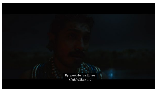
Figure 11: Namor revealing his name (0:27:43)