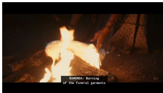
Figure 9: Shuri's and Queen Ramonda's mourning ritual (0:25:53)

Further, gold can also suggest even greater luxury and elegance when it is combined with black. The Black Panther's luxury and elegance are associated with the Black Panther being a member of Wakanda's royal family and their reign over the prosperous kingdom due to the rare metal on earth, vibranium. Shuri possesses prestigious status by being a member of the royal family and also a brilliant scientist. Her prestigious status is enhanced when she continues the legacy of the Black Panther by becoming the new one.