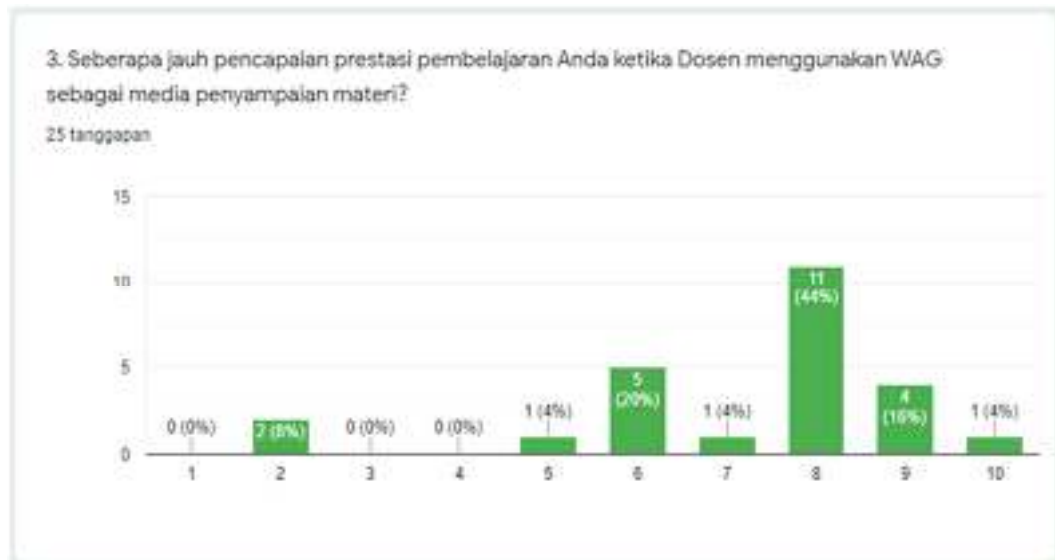
Table 3. Students' perception toward the use of WhatsApp