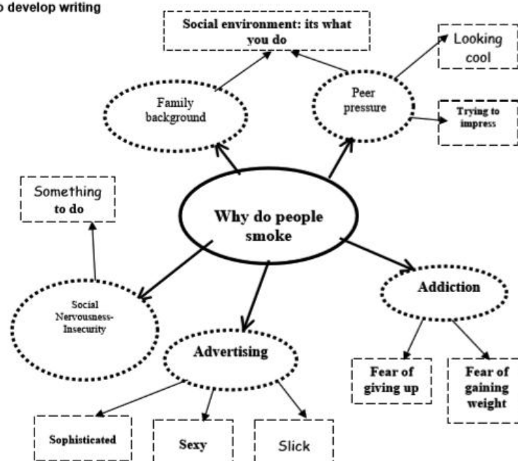
Figure 1. Model of Mind Maps Adopted from BBC (2015)

As written by Steele (BBC, 2015) and cited from Writing Centre Learning Guide of the University of Adelaide, several steps can be followed to use mind map. First step is choosing a topic. Students may prefer to nominate the topic themselves. This can lead to greater interest in the task on the part of the student, as well as, perhaps, greater knowledge of the topic under study. The mind map strategy can be used to explore almost any topic, though discursive essays and narrative work particularly well as they front students' ideas and lend them to discussing ideas in groups. However it is carried out, it is important to provide a context and audience. Having an audience in mind helps students to decide which ideas are most important, and also helps students to choose the appropriate style.