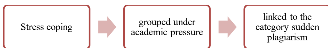
Figure 2. From raw data to conceptual categories

Initial open coding identified recurring expressions such as “reduce writing stress,” “many students plagiarise,” and “I cannot produce my own sentences.” These were grouped into first-order codes (e.g., stress reduction, social normalization, linguistic difficulty). Through axial coding, these were clustered into higher-order categories: personal rationales, academic pressures, and technological affordances. Finally, selective coding integrated these into a process model of plagiarism decision-making. For example, one participant stated: “I copy some texts... to reduce writing stress” (P13).