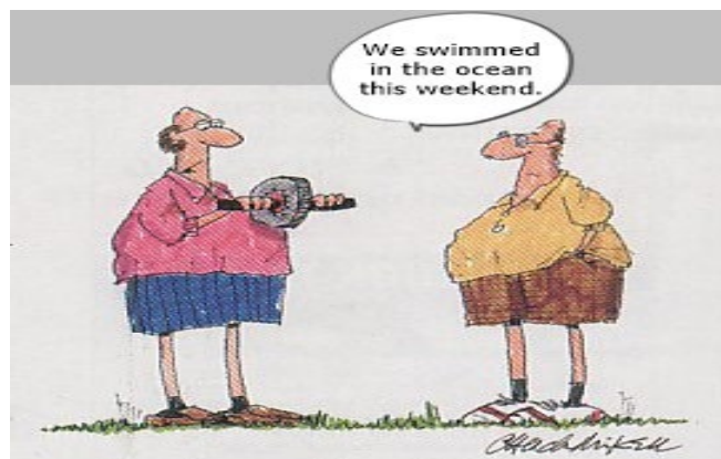
Figure 3. Grammatical error made by a native speaker

"We swimmied in the ocean this weekend."