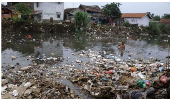
Figure 1. The condition of Indonesian waters 19

waterways. 18 The lack of integrated waste management systems, coupled with limited public environmental awareness, has exacerbated the decline in water quality and contributed to broader ecological and public health risks.