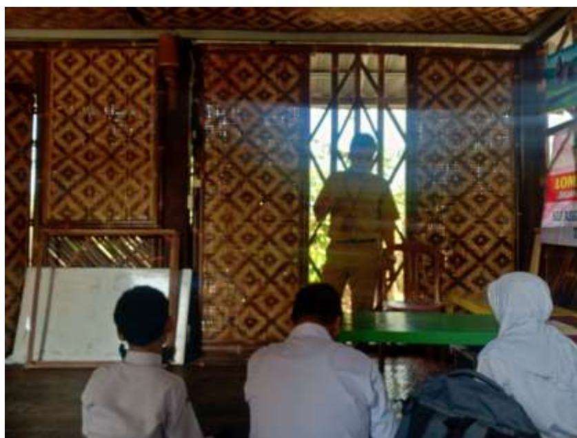
Figure 2. Teachers provide PAI materials

With this condition, in the learning process, they emphasize more on other senses, namely the sense of hearing and touch, as shown Figure 1. In this case, the principle that must be considered in providing teaching to visually impaired children is that the tools used must be factual and have a voice, so those visually impaired children can feel and listen, for example, such as the use of braille, objects that are real, and embossed images. Meanwhile, media that can produce sound are examples, such as tape recorders and jaws software. To help visually impaired children do activities in extraordinary schools as well as in the home environment, they learn how to know the place and directions and how to use a white cane explicitly made for the visually impaired made of aluminum ( Dermawan, 2013 ).