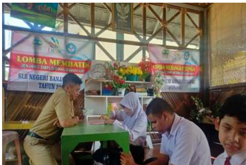
Figure 3. Teachers Close PAI Learning

Teachers ask questions related to the material studied before the class ends. In addition, the teacher examines the materials provided, summarizes and motivates children with vision problems, as shown Figure 3. After that, it is pronounced hamdallah together, and the teacher ends it with a greeting.