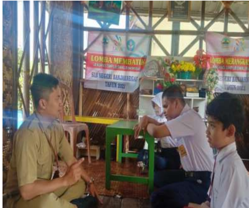
Figure 1. Teachers Provide PAI Materials

With this condition, in the learning process, they emphasize more on other senses, namely the sense of hearing and touch, as shown Figure 1. In this case, the principle that must be considered in providing teaching to visually impaired children is that the tools used must be factual and have a voice, so those visually impaired children can feel and listen, for example, such as the use of braille, objects that are real, and embossed images. Meanwhile, media that can produce sound are examples, such as tape recorders and jaws software. To help visually impaired children do activities in extraordinary schools as well as in the home environment, they learn how to know the place and directions and how to use a white cane explicitly made for the visually impaired made of aluminum ( Dermawan, 2013 ).