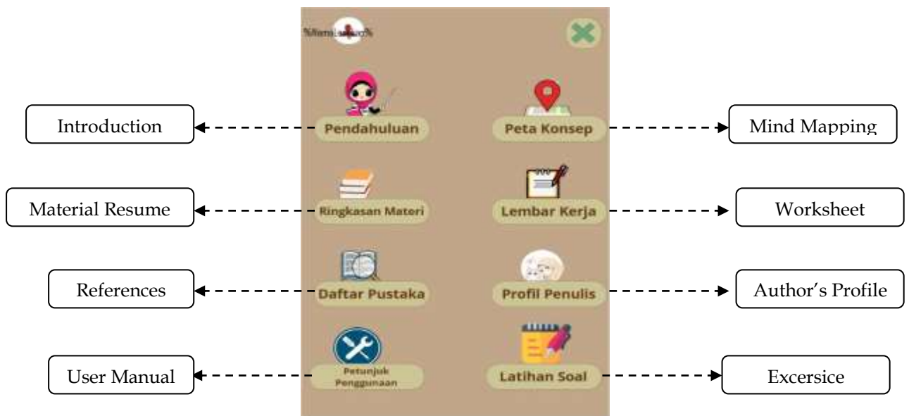
Figure 2. Main Menu