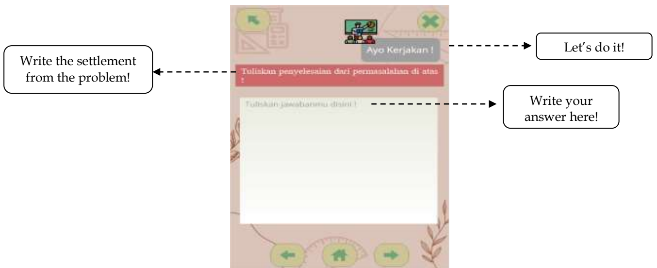
Figure 6. PBL-Based Worksheet Page Display