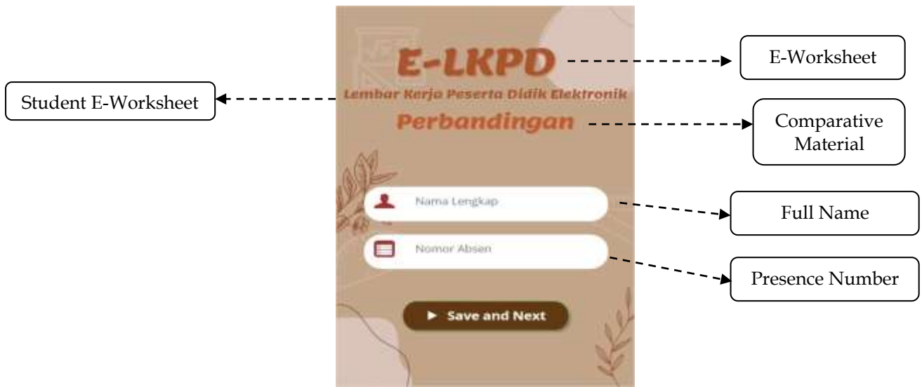
Figure 1. Cover display E-worksheet