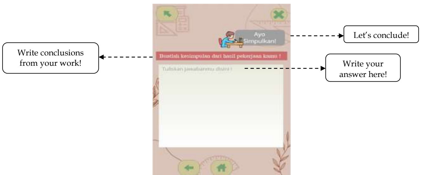
Figure 7. PBL-Based Worksheet Page Display