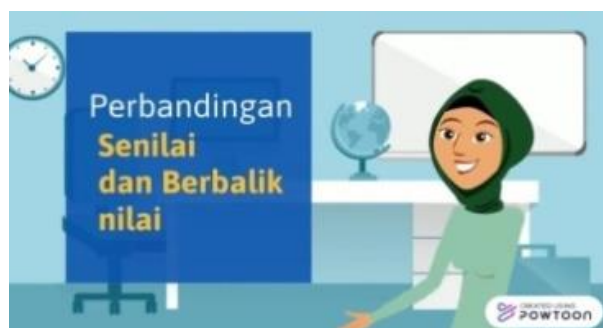
Figure 1. Opening

This stage is where the researcher creates animation-based learning videos about comparisons according to what was conceptualized and designed in the previous stage and develops media assessment instruments that will be tested in the next stage. The instruments created are validated first before being used for assessment. There are several views of the learning videos developed: