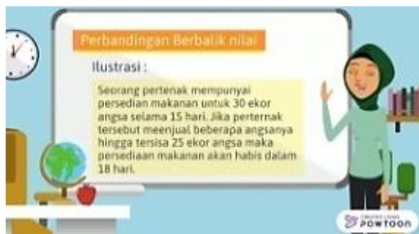
Figure 3. Material Explanation

Figure 3 explains the core material about fractions. After the apperception stage, students are taken to the core material of the module. The material presented is in the form of illustrations to help students have the most accessible picture of learning mathematics. Apart from pictures, reinforcement is also provided through learning videos ( Lestari and Handayani, 2018 ).