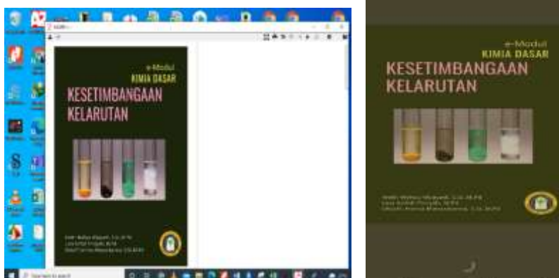
Figure 1. The Display of e-Module Accessed using Laptop/Computer (left) and Smartphone (right)

Based on the result of the product analysis, the guided inquiry-based solubility equilibrium e-module product was developed in the ePUB (electronic publication) format. The e-module was developed using Sigil software which was the open source. The e-module could be only opened using the ePUB reader application. Here is the initial display of e-module when it was accessed using a laptop/computer with Azardi application (the left Figure 1) and using the Smartphone with the Moon+ Reader application (the right Figure 1).