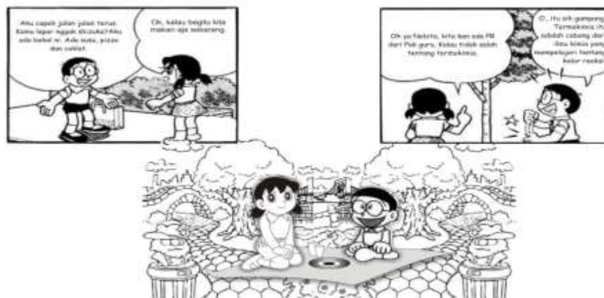
Picture 2. Sample of Comic by Using Corel and Adobe Photoshop CS3

book of Thermochemistry by using Corel and Adobe Photoshop CS3.