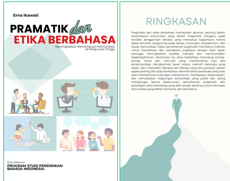
Figure 2. Design Research by Module