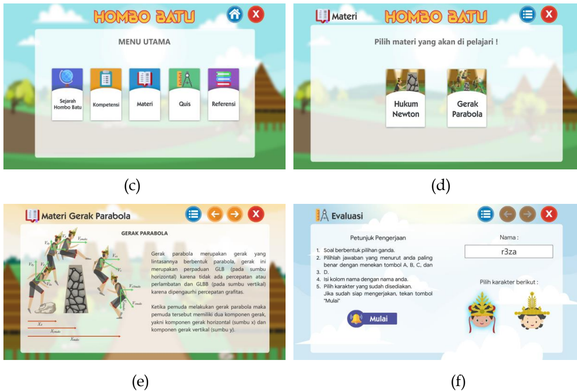
Figure 1. Appearance of Ethnophysics-Based Mobile Learning: (a) Cover, (b) Navigation, (c) Main menu, (d) Physics Materials, (e) Concept of Newton Laws, and (f) Assessment

The mobile learning platform "Hombo Batu" for physics education represents an innovative approach rooted in ethnophysics, specifically integrating the cultural elements of the Hombo batu. The platform includes several key components to enhance the learning experience. The cover of the platform (figure 1a) showcases thematic elements related to ethnophysics, establishing a cultural connection right from the outset. The table of contents is meticulously organized to facilitate easy navigation through various topics, ensuring students can access relevant materials efficiently.