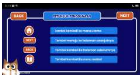
Figure 5. The User Manual

Figure 4. The menu presents three main material buttons to be studied: the form of matter, changes in matter and particles of matter. There is also a back button to return to the previous page (main menu).