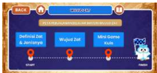
Figure 7. A Learning Map