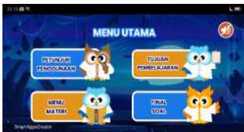
Figure 3. The Main Menu Displays Menu Buttons

Figure 1. It is the front cover display of the application, consisting of images, illustrations, text, and a start button. The cover is very important because it is the first part when the application is opened, so it is made as attractive as possible so that students are interested in learning to use CHEM-OWL. Figure 2. The login menu is a login column that must be filled in before proceeding to the application's main menu; login is designed only for formality because student data is not stored in the application system. However, the login column is part of the interactivity of the CHEM-OWL application.