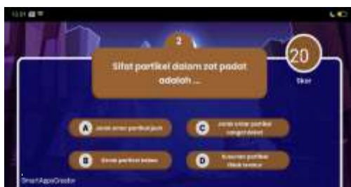
Figure 9. Mini Quiz Game

Figure 8. Presents the contents of the discussion of the material in the form of text, images, videos, illustrations, animations, charts, and symbols that make it easier for students to understand the learning material.