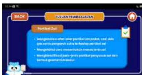
Figure 6. Displays The Learning Objectives

Figure 5. The user manual explains how to use the CHEM-OWL application regarding the functions and interactions of the existing buttons.