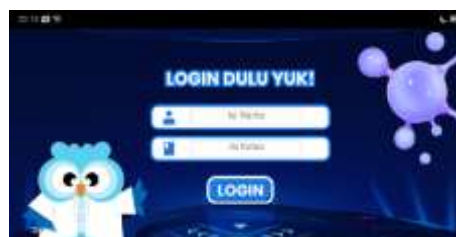
Figure 2. The Login Menu