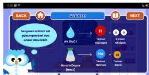
Figure 8. The Contents of The Discussion of The Material

Figure 7. A learning map designed to break down the material into several sequential stages, from the start to the finish mark. This map aims to attract students' attention and make it easier for students to understand learning materials sequentially.