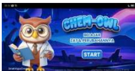
Figure 1. The Front Cover Display of The Application

The initial design consists of making a flowchart and storyboard. The media display design process is carried out using Figma design software and then continued with the process of compiling and integrating each layout, interaction buttons, animations, background, and other interactivity in the CHEM-OWL application using the help of Smart Apps Creator (SAC) software. Then, the file is exported into an APK format application that can be installed and run on Android-based smartphones. The following is a design for the CHEM-OWL interactive learning application.