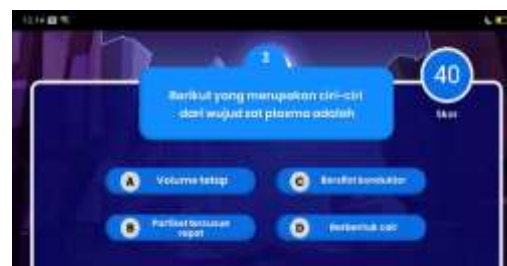
Figure 10. The Final Quiz

Figure 9. Mini quiz game in the form of 5 multiple choice questions that students must complete before reaching the finish. Each material has a quiz that functions as independent practice and tests their understanding after completing the learning sub-material. This section has a more interactive side where the media can respond to whether the answer is right or wrong.