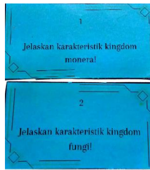
Figure 2. Question Card