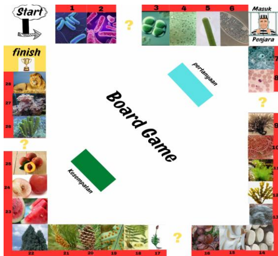
Figure 1. Board Game Media

Pictures 1, 2 and 3 display a board game developed by adding question cards, cha, lovely cards, dice and pawns. One set of this game is also equipped with a game guide, scoring for players, and answer keys. The rules of the game are 1) the game can be played by a minimum of 2 people and a maximum of 4 students, 2) one student acts as a judge who reads the questions to the players, 3) if the player has thrown the dice and stepped on the box can answer the question correctly then he is allowed to continue the game, 4) players who cannot answer remain in the initial step box, and take turns playing with the opposing player if they cannot answer board game device that includes the material of classification of living things with learning indicators including identifying the characteristics of living things and identifying class characteristics to species in several kingdoms. Material experts carry out the validation stage. It is used to assess the products that have been developed, namely the value of the aspects of content validity and language validity.