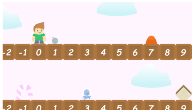
Figure 3. Count-IT! Game display

The picture above is the design of the menu display in the Count-IT game! developed. On the menu display there are various buttons, namely the START button to start the game, the star-shaped button to view game instructions information, the audio button to adjust the volume, and the X button to exit the game.