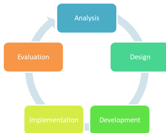
Figure 1. Development Model Procedure