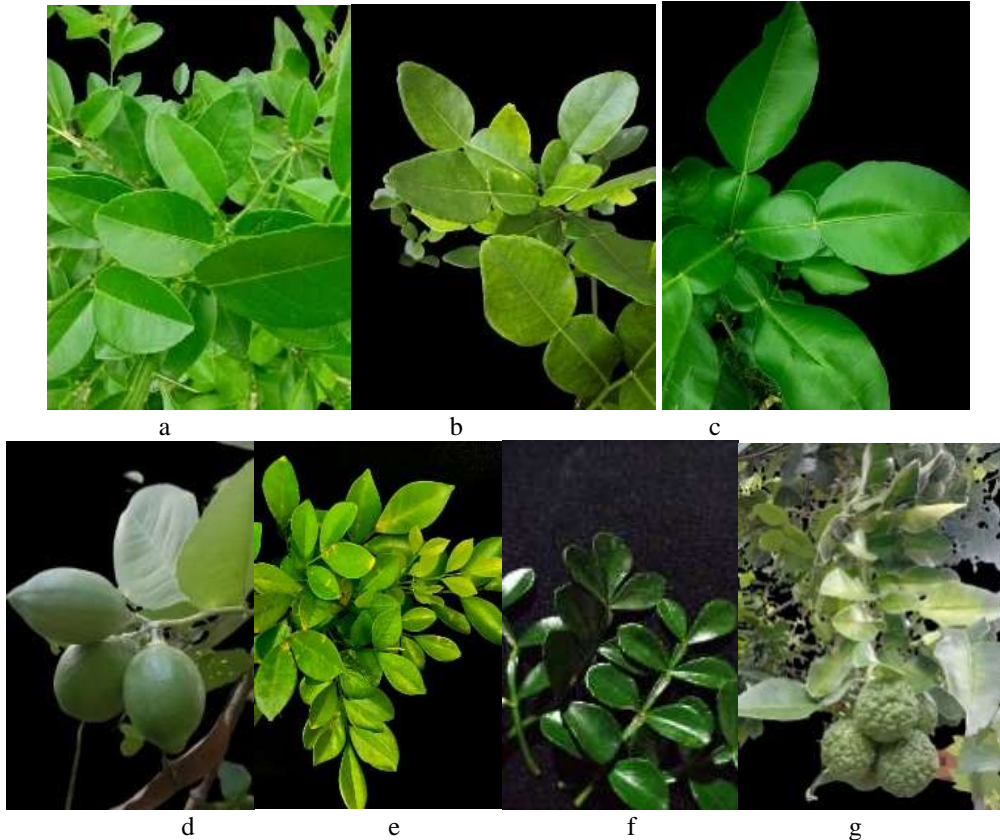
Figure 1. Description: a. Aurantifolia swingle ; b. Citrus hystrix ; c. Citrus maxima ; d. Citrus limon ; e. Murraya paniculate ; f. Limonia acidissima ; g. Citrus paradisi

We used 7 species of the family Rutaceae because these species grow in Indonesia and the description of their taxonomic affinity is not well known. The comparison of the morphological forms of the 7 species could be seen in Figure 1.