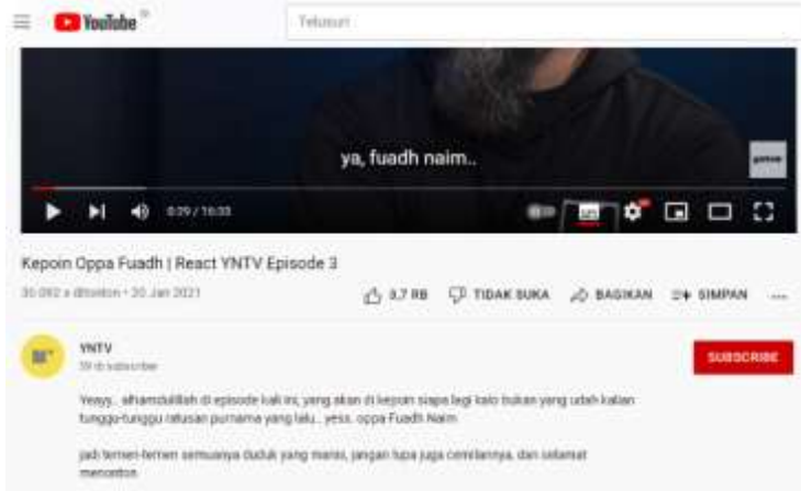
Figure 1. YukNgaji content that uses popular Korean terms

One of them is listed in the video "Kepoin Oppa Fuadh" (Figure 1). Oppa (오빠) means "older brother". In the Korean setting, this nickname is only used when a woman calls an older brother or an older man whom she trusts. It is also popular as a nickname for male Idols (K-pop boy-group members) or Korean actors.