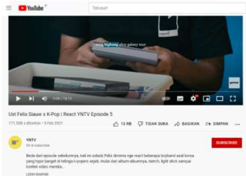
Figure 6. Ustad Felix Siauw Reaction Video

In the video "Ust Felix Siauw x K-Pop" (Figure 6), Ustad Felix Siauw is seen reacting to the album and Lightstick of Korean Idol. This video can also be interpreted as a form of introducing one of the K-Pop media to religious figures who are generally not identical to K-pop. Ustad Felix Siauw's first response when reacting to KPop goods is to appreciate the Korean Idol album with the sentence "The first time I saw this (Korean Idol album), it looked like a special item".