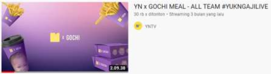
Figure 4. Cover of #YUKNGAJILIVE stream with BTSxMcD vibes

The YukNgaji community also uploads content with a similar setting and feel to the concept (Figure 4).