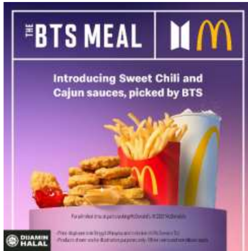
Figure 3. BTS Meal Menu

between BTS, one of the K-Pop boy-groups, and McDonald's went viral in June 2021 in Indonesia.