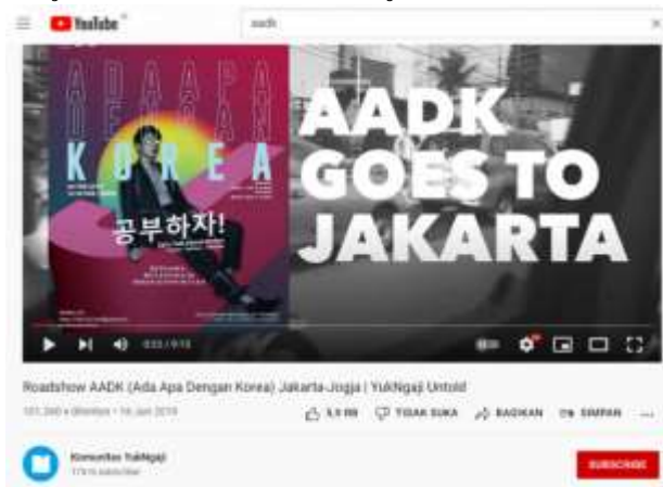
Figure 2. YukNgaji Content Using Popular Korean Terms

In the AADK (Ada Apa Dengan Korea) Jakarta-Jogja Roadshow video (Figure 2), it was also found that the preacher used Korean greetings such as "안녕하세요 (Annyeong haseyo)" which means "How are you?".