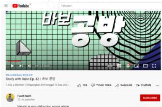
Figure 7. Episode 42 Study with Babo

One of the da'wah strategies for KPopers (Korean Pop Fans) and Kdreamers (Korean Drama Fans) is by opening a Korean language learning class. This class was initiated by Fuadh Naim through his YouTube Channel. This activity is known as Study Korean with Babo (바보 공부방) which airs every Monday-Friday at 21.00 WIB via YouTube streaming (Figure 7).