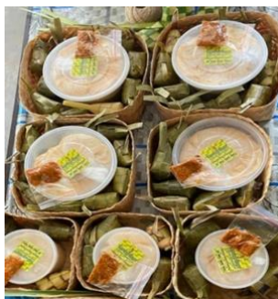
Fig.4: Photo title: Kandangan ketupat packaging