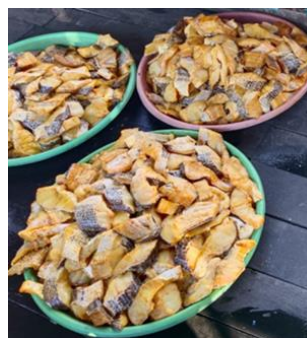
Fig.5: Photo Title: Snakehead Fish Before Smoking.

The Kandangan ketupat dish has many benefits from the ingredients used. In 100 grams of unus Siamese rice contains high fiber 3.14% and low carbohydrate content 12.5% and a glycemic index of 52.33%, making it suitable as a choice of ingredients in carrying out a mellitus diet 47 . Snakehead fish contains high albumin levels of 19.61% in a fish weight of 900 grams, the high albumin content of snakehead fish can help the wound healing process 48 . Snakehead fish before being smoked which is smeared and left for 3 hours is shown in figure 5.