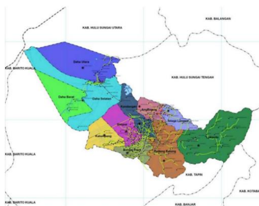
Fig.2: Photo Title: Map of Hulu Sungai Selatan Regency

local dishes such as dodol and ketupat Kandangan also decorate the uniqueness of Hulu Sungai Selatan Regency tourism. Various cultures complement the uniqueness of the Kandangan area such as the kalang hadangan and aruh ganal traditions of the Dayak Meratus tribe 28 . Various industries also complement the diversity of tourism and culture in Hulu Sungai Selatan district such as pottery crafts and iron and steel processing 29 . It can be concluded that Kandangan has various interesting things in the fields of culture and tourism, so that it can attract local and foreign tourists to visit. Figure 2 shows the map of Hulu Sungai Selatan district.