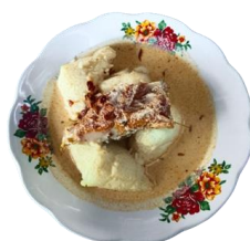
Fig. 8. Kandangan Ketupat South Kalimantan

From the observation result at the ketupat Kandangan Kaum food stall, the color of the ketupat Kandangan is white, the sauce is light brown and the smoked snakehead fish is dark brown. The texture of the ketupat is slightly hard (pera), the sauce is slightly thick and the smoked snakehead fish has a soft texture. The aroma of the ketupat is fragrant because of the young coconut leaves and superior local rice, the sauce has a spice aroma cooked with coconut milk and the snakehead fish has a distinctive aroma from smoking from coconut shells. The taste of the ketupat Kandangan is slightly sweet, while the sauce has a savory and slightly salty taste and the snakehead fish has a sweet taste. The ready-to-serve ketupat Kandangan dish is shown in figure 8. In addition, Betawi vegetable ketupat is also shown in figure 9 & Padang vegetable ketupat in figure 10 for comparison.