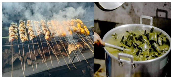
Fig.6&7: Photo Title: smoking fish and cooking ketupat

A good ketupat has a stiff texture and can absorb the sauce. Snakehead fish is the main side dish served with Kandangan ketupat because it has a soft meat texture that easily absorbs the sauce and has a distinctive taste 49 . Snakehead fish smoked for 8 hours in coconut shells is shown in figure 5. Kandangan ketupat boiled for 2.5 hours is shown in figure 6.