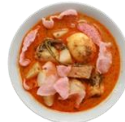
Fig. 10. Sayur Ketupat West Sumatera