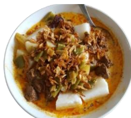
Fig. 9. Babanci Ketupat Jakarta