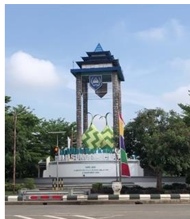
Fig.3: Photo Title: Kandangan Ketupat Monument.

the year of birth in 1950 35 . Figure 3 shows the Kandangan ketupat monument which is an icon of Hulu Sungai Selatan District.