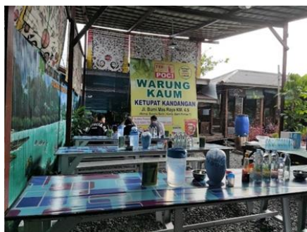
Fig.9: Photo Title: Kaum Ketupat Kandangan Stall.

In Sungai Baru Village, there is an area called Kampung Ketupat, the economic activities of the local community are processing and marketing Kandangan ketupat 55 . So we can conclude that places selling Kandangan ketupat are widely spread across Kandangan City and Banjarmasin City. The most famous restaurant in Banjarmasin City that sells Kandangan ketupat dishes is shown in Figure 9.