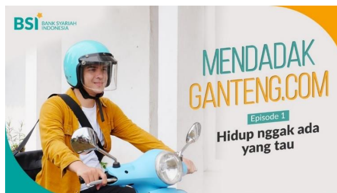
Image 1. BSI’s web series thumbnail on Youtube