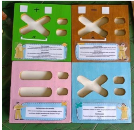
Figure 1. Media size 60 x 60 cm