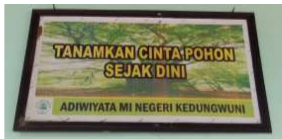
Figure 4. Environmental Love Poster