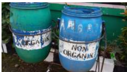
Figure 3. Organic and Non-Organic Trash Cans in Every Class