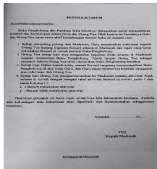
Figure 2. General Instructions for Filling Out Connection Books