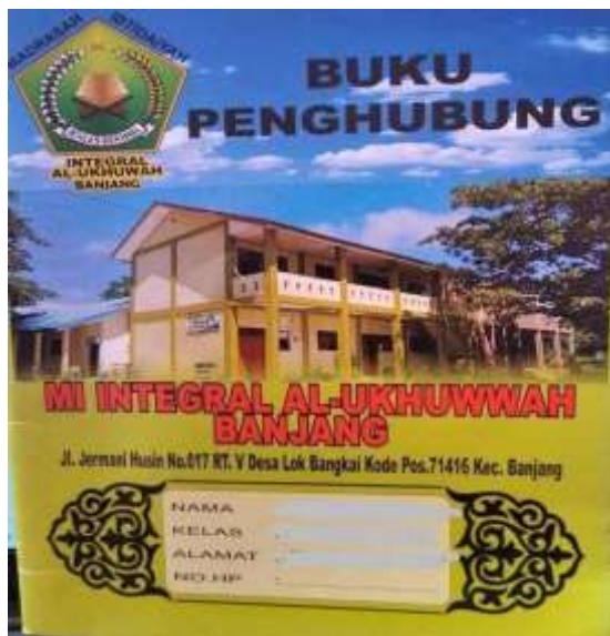
Figure 1. The Connection Book for MI Integral Al-Ukhuwah Banjeng

The documentation that the researchers obtained is a photo of the connection book, instructions for filling in, and examples of filling in the aspect of worship that focuses here are prayer. Figure 1 shows the cover of the connection book.