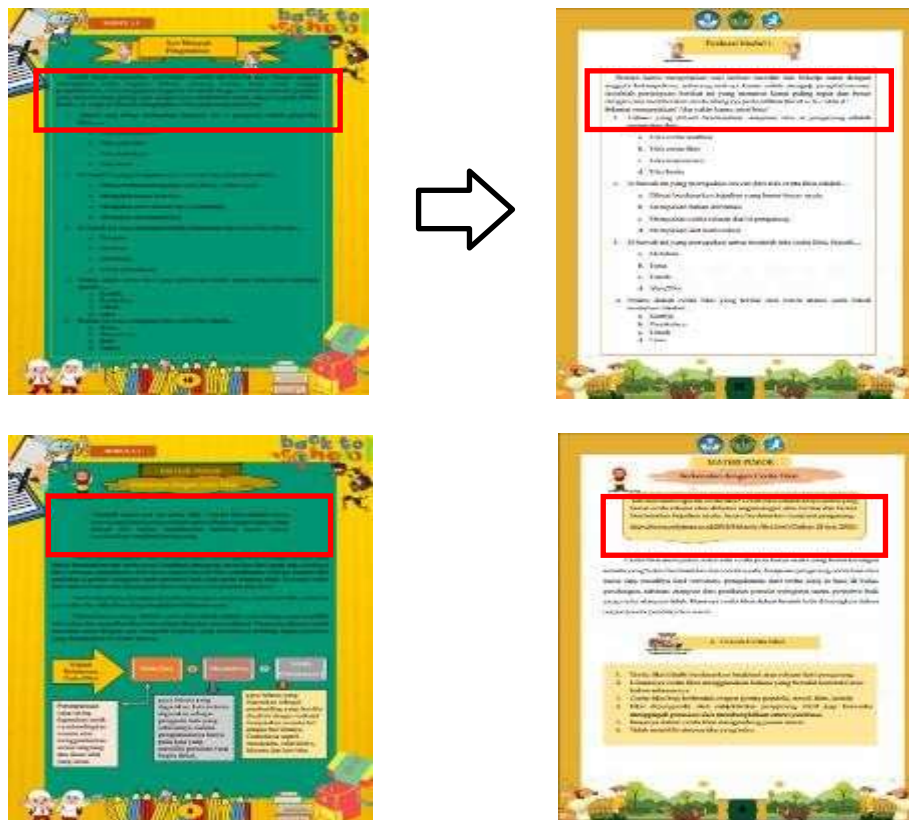
Figure 4. Before and After Revision

The last assessment of the linguist validated by the linguist, Mr. Andesten, M.Pd, obtained a percentage of the feasibility level of 84.61% with a very valid category. The validator provides suggestions for correcting typo or wrong words, choosing words according to (EYD) which are good as in the evaluation module "After you have worked on independent practice questions and worked together with your group members during discussion activities, now is the time for you to test your knowledge. The way to do this activity is to choose one of the answers that you think is the most appropriate by putting a cross (x) on the letters a, b, c, or d "to" After you have done the independent practice questions and collaborated with your group members, now it's time for you to test your knowledge Answer the following questions that you think are most appropriate and correct by putting a cross (x) in the choice of letters a, b, c or d "and including the source of the reading used in each explanatory text of the material as shown in Figure 4 below: