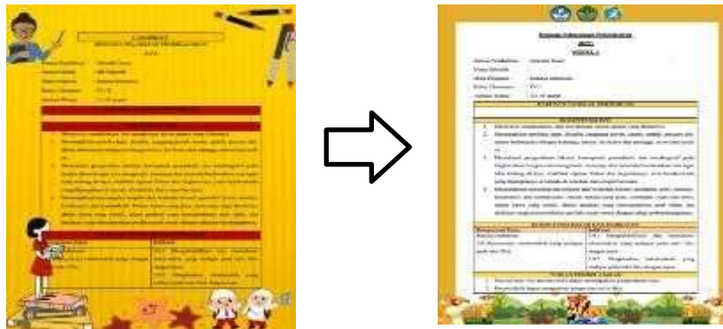
Figure 3. Before and After Revision

The last assessment of the linguist validated by the linguist, Mr. Andesten, M.Pd, obtained a percentage of the feasibility level of 84.61% with a very valid category. The validator provides suggestions for correcting typo or wrong words, choosing words according to (EYD) which are good as in the evaluation module "After you have worked on independent practice questions and worked together with your group members during discussion activities, now is the time for you to test your knowledge. The way to do this activity is to choose one of the answers that you think is the most appropriate by putting a cross (x) on the letters a, b, c, or d "to" After you have done the independent practice questions and collaborated with your group members, now it's time for you to test your knowledge Answer the following questions that you think are most appropriate and correct by putting a cross (x) in the choice of letters a, b, c or d "and including the source of the reading used in each explanatory text of the material as shown in Figure 4 below: