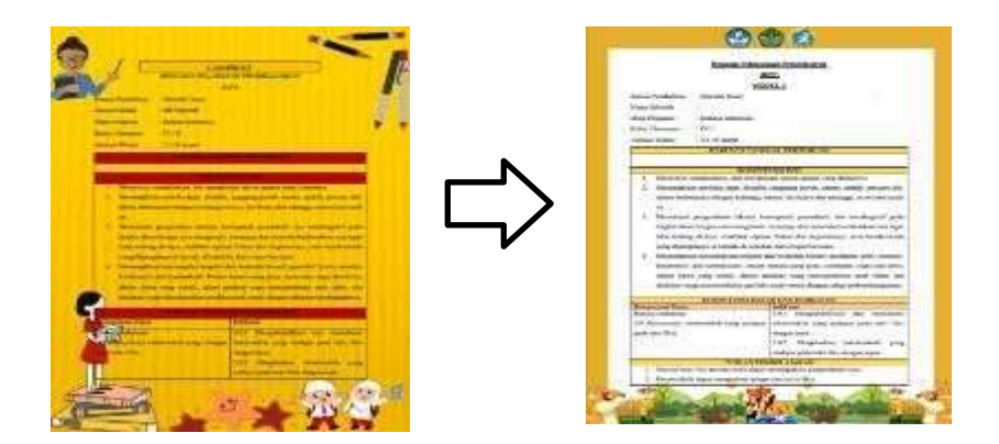
Figure 3. Before and After Revision

The last assessment of the linguist validated by the linguist, Mr. Andesten, M.Pd, obtained a percentage of the feasibility level of 84.61% with a very valid category. The validator provides suggestions for correcting typo or wrong words, choosing words accordingto (EYD) which are good as in the evaluation module "After you have worked on independent practice questions and worked together with your group members during discussion activities, now is the time for you to test your knowledge. The way to do this activity is to choose one of the answers that you think is the most appropriate by putting a cross (x) on the letters a, b, c, or d "to" After you have done the independent practice questions and collaborated with your group members, now it's time for you to test your knowledge Answer the following questions that you think are most appropriate and correct by putting a cross (x) in the choice of letters a, b, c or d "and including the source of the reading used in each explanatory text of the material as shown in Figure 4 below: