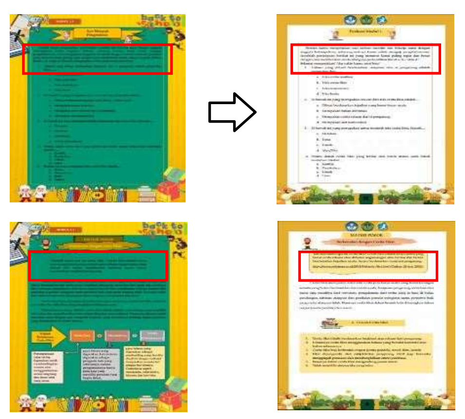
Figure 4. Before and After Revision

The last assessment of the linguist validated by the linguist, Mr. Andesten, M.Pd, obtained a percentage of the feasibility level of 84.61% with a very valid category. The validator provides suggestions for correcting typo or wrong words, choosing words accordingto (EYD) which are good as in the evaluation module "After you have worked on independent practice questions and worked together with your group members during discussion activities, now is the time for you to test your knowledge. The way to do this activity is to choose one of the answers that you think is the most appropriate by putting a cross (x) on the letters a, b, c, or d "to" After you have done the independent practice questions and collaborated with your group members, now it's time for you to test your knowledge Answer the following questions that you think are most appropriate and correct by putting a cross (x) in the choice of letters a, b, c or d "and including the source of the reading used in each explanatory text of the material as shown in Figure 4 below: