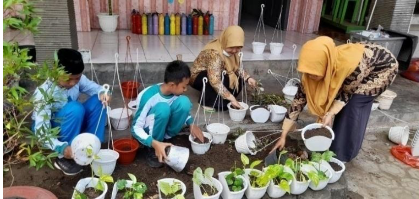
Figure 1. Plant Maintenance Activities

This statement indicates that the school's environmental orientation is rooted in an eco-theological understanding of Islamic education. Students were encouraged to see environmental care not only as a school rule, but also as a form of worship and responsibility as God's stewards on earth.