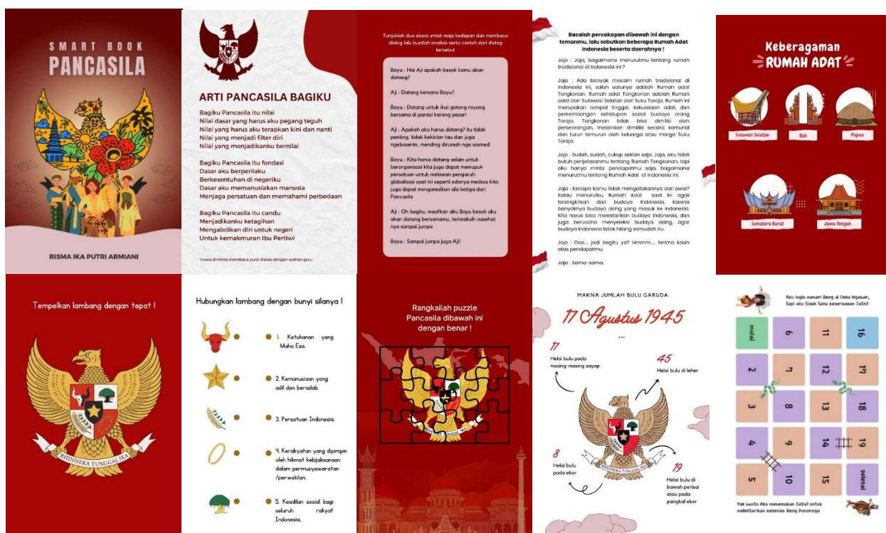
Figure 1. Design of Smart Book Pancasila Learning Media

The educational learning media in the form of the Smart Book Pancasila is designed to help improve the frequency of basic literacy among elementary school students in a fun and interactive way. This book combines various elements, such as reading materials, poetry, and educational games, to enhance students' reading and writing skills. Additionally, the Smart Book Pancasila is equipped with knowledge about Indonesian culture, providing students with a deeper understanding of the nation's cultural heritage and noble values. Its usage is guided by the teacher to ensure understanding of the material and to support an effective learning process. This book is used in Civics and Pancasila Education (PPKN) and Indonesian language lessons to strengthen character and literacy in students from an early age. The book's thick and durable design is made to be used repeatedly in lower-grade classes, making it a long-lasting and efficient learning tool to support the development of children's basic literacy.