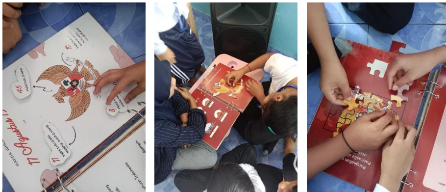
Figure 3. The Role of Smart Book Pancasila in Fostering the Spirit of Nationalism

Through all the implementations in Smart Book Pancasila, students not only learn about Pancasila and nationalism but are also equipped with a sense of pride in the country and Indonesian culture. This interactive-based learning makes it easier for students to internalize national values, fostering a strong love for their homeland and nationalism. In a fun and meaningful way, Smart Book Pancasila becomes an effective tool in shaping a nation's character, one that loves its homeland and embodies the spirit of Pancasila.