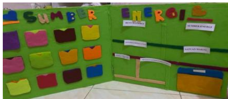
Figure 2 Word board Media Before Revision

The application of design features is critical, especially in the process of colouring and product layout, by displaying graphic figures that are unique, attractive, and easy to be recorded by the brain and sensory eyes so that they can provide interest, comfort, and first impressions in using the product (Baaqi & Aryanto, 2022). According to Handayani & Lutfi, (2023), Using colour in data visualization is an important element that affects users' perception, understanding, and interpretation of the information presented. Proper principles in the application of colour can improve the effectiveness of visual communication, while improper use can lead to difficulties in understanding and even distortion of information.