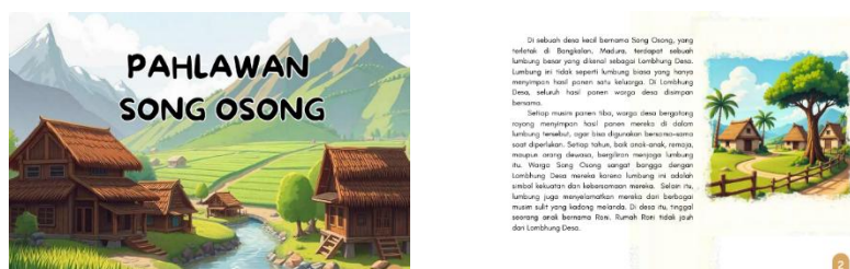
Figure 3 of The Picture of Local Wisdom 1