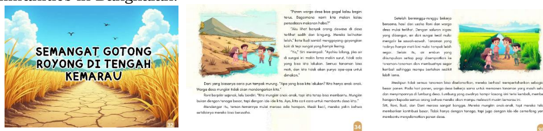
Figure 5 of The Picture of Local Wisdom 3

In this story, the tradition of "Rokat Tasek" is celebrated once a year by coastal communities in Bangkalan.