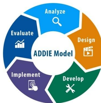
Figure 1 ADDIE Model

Research and Development Model: This research uses research and development (R&D) methods (Laws, 2013). The research model used in this study is using the ADDIE model to design a learning system. ADDIE is a research model that involves the stages of model development with five stages or phases of development, including (Rusmayana, 2021): 1) Analysis, 2) Design, 3) Development, 4) Implementation and 5) Evaluation. The following are the steps of ADDIE's development research in the form of a chart, namely: