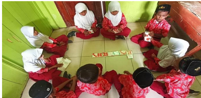
Figure 4. The Implementation of Domino Card

Based on the implementation results, the effectiveness of the domino card learning media can be obtained based on the student's response questionnaire and the results of students' learning improvement through the pretest and posttest questions given. Testing development products in improving learning outcomes using the One Group Pretest-Posttest N-gain Score design normality test. The following picture is during the application of domino cards in the classroom;