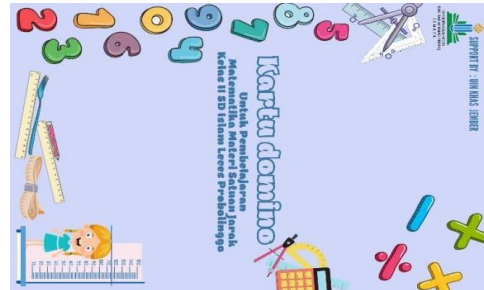
Figure 2. Product Packaging Sticker Design