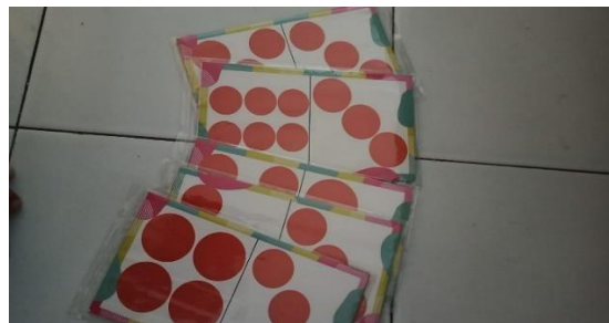
Figure 3. The Domino Card