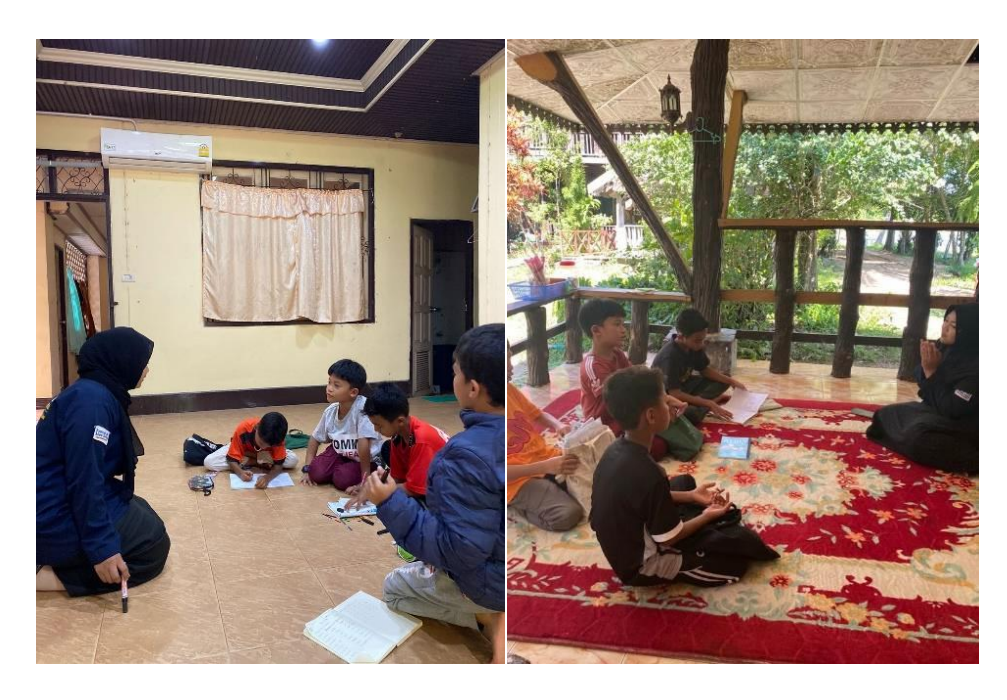
Vocabulary Sharing Learning Process at Miracle Language Center

As for during the activity, there is an evaluation of the implementation of the activity, namely: The material that has been taught in the previous meeting is repeated when new material is presented, with the aim of connecting interconnected concepts and strengthening children's mastery of foreign languages. If students are absent from the activity, they are expected to provide reasons for absence to the teacher as a form of discipline and responsibility. When implementing activities, practical and efficient learning strategies and methods are needed, so that students can easily understand foreign language materials. The goal is to make foreign language learning more interesting and fun for students. After completing the lesson, the implementer needs to conduct an evaluation session through questions and answers about the material that has been taught. This aims to strengthen students' understanding of the foreign language. In learning vocabulary material, the successful achievement is that students are able to memorize more than ten vocabulary words given. The charades method helps students concentrate on memorization.