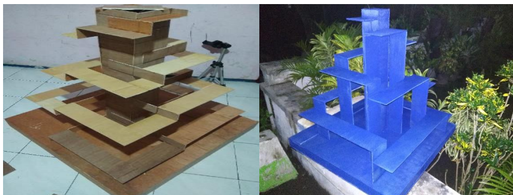
Figure 2: Product Development Process

At this stage of media making, researchers create real and three-dimensional media concepts. So that it looks more attractive for students to be motivated, enthusiastic and active in the learning process. This media is made from plywood base material which is cut in such a way and assembled into a snakes and ladders game-based math learning media.