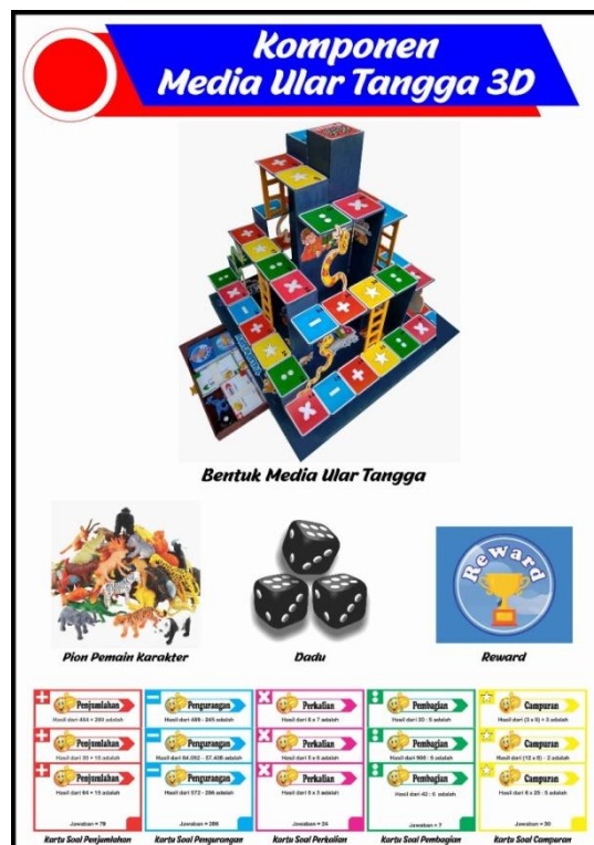
Figure 3. 3-Dimensional snakes and ladders media display

The components of the 3-dimensional snakes and ladders media described above can be seen in the following figure: