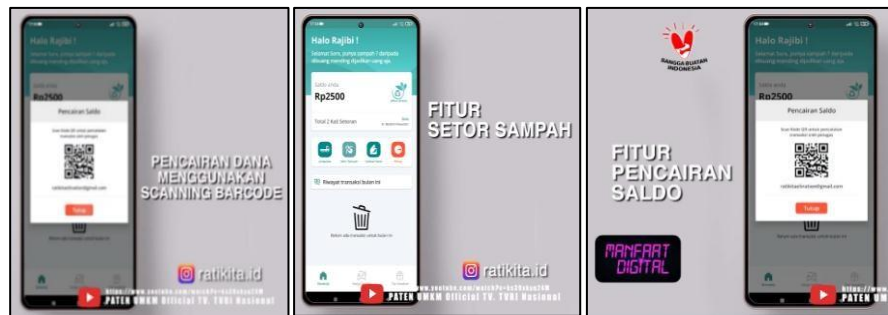
Figure 4. 3 Waste Deposit and Balance Disbursement Features