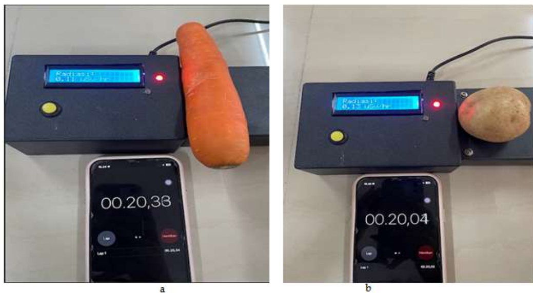
Figure 2. Observation Results: (a) Carrot 0.11 \mu\text{Sv/hr} , (b) Potato 0.13 \mu\text{Sv/hr}

The results of the study showed that measurements of radioactivity levels in two types of natural food ingredients, namely carrots and potatoes, produced values of 0.11 \mu\text{Sv/hr} and 0.13 \mu\text{Sv/hr} . These values are within safe limits according to international standards (IAEA, 2020), which state that natural exposure levels in the environment range from 0.05\text{--}0.20 \mu\text{Sv/hr} . These results indicate that both food ingredients have normal levels of natural radioactivity and are not harmful to human health. However, the small difference between the two values is interesting to study in the context of learning scientific literacy, because it opens up space for students to interpret data scientifically, trace natural radiation sources, and understand the relationship between food ingredients and the geophysical environment in which they grow. The results of the observations can be seen in Figure 2.