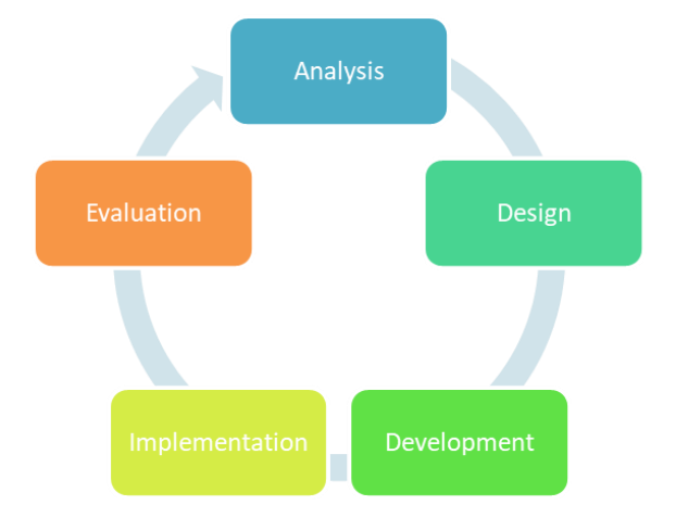
Figure 1. Development Model Procedure