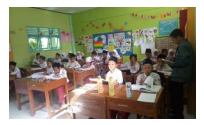
Figure 4. Literacy Activity In Classroom

Literacy activities in the teacher's class can be carried out by applying a suitable method; students can read together with different books according to their preferences of students. Then after the students finished reading, they were asked to ask each other about the content they read and tell according to their ability. In addition, teacher creativity in using teaching methods and using learning media is very necessary so that learning media, such as stories and games, can influence the learning process to be effective. This method can foster students' interest and enthusiasm for reading while at the same time increasing students' understanding of a reading text (Ratnawati & Asniawati, 2020). This method can activate students to work together with others and strengthen relationships between students. It also realises student-centred teaching and learning activities (student centre). In addition to the above, this can also build student awareness of learning. Figure 4 is a form of literacy activity carried out by students under the teacher's guidance.