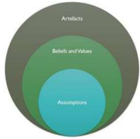
Figure 2. Culture Layer

Stop and Smith in Subiyantoro explained that the cultural layer could be separated into three parts: artifacts, beliefs, and assumptions. First, artifacts, namely cultural layers, can be seen directly, such as daily rituals carried out at Madrasas, such as flag ceremonies, tahfiz, Dhuha prayers, and increasing student literacy. The second layer relates to the values and beliefs in educational institutions, such as greeting when entering class, praying before studying, respecting teachers, maintaining cleanliness and others. It is the main characteristic of madrasas, while the last layer is about thinking because they consider that what is being done is right (Subiyantoro, 2013).