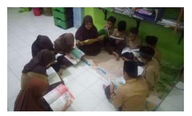
Figure 3. Student Literacy Activity

Literacy activities at MI Qurrota A'yun are carried out routinely every Friday, showed in Figure 3. When the literacy activities were carried out, the children were delighted and enthusiastic, and it was seen that when the literacy activities were to be carried out, the students were ready and holding the books they had. In contrast, the target of this literacy activity was more inclined to the child's ability to understand the contents of the reading. To strengthen students' memory and understanding of the reading contents, we asked them to retell the points that could be learned from the contents. Literacy activities are carried out using the question-and-answer method and discussion.