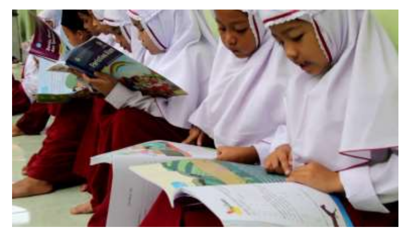
Figure 5. Literacy Activity Outside Classroom

"During the literacy activity, all the books were available on the bookshelves and corners of the classroom. All classroom teachers already have schedules to assist students' literacy activities, scheduled every Friday. Forms of literacy activities outside the classroom can be done anywhere, including on the front page of the class.