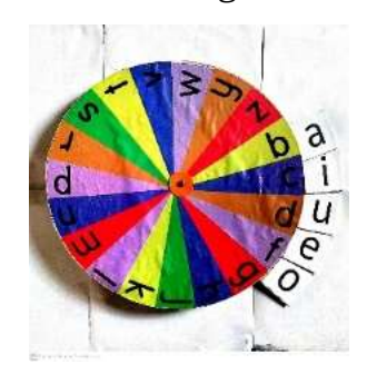
Figure 2. Smart Wheel Media After Revised